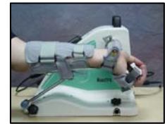
Maestra Wrist CPM